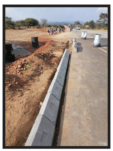
Linina kerb stones at Mhandamabwe intersection.