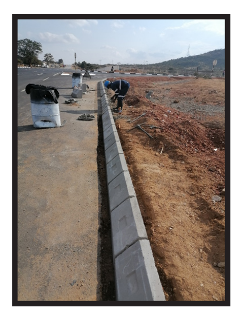
Mhandamabwe intersection last stretch of kerb stones being installed.

Shepherd and team were in attendance to do some house-