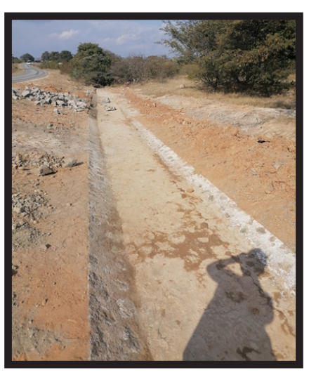
Stone pitching in progress.

L channels are being replaced by new ones delivered from